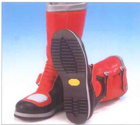
BMW GORE-TEX® boots.

Up-to-date driver's equipment now includes matching GORE-TEX® boots: Here too the GORE-TEX® material guarantees total weather protection. It is absolutely wind-proof and watertight but has an active breathing effect at the same time. Other advantages include: Plastic reinforcement pads around the ankles, reflective stripes on the rear of boot, shaft reinforcement on the forefoot, slip-resistant and antivibration soles. The elastic seam and the three-fold velcro fastening enhance comfort.