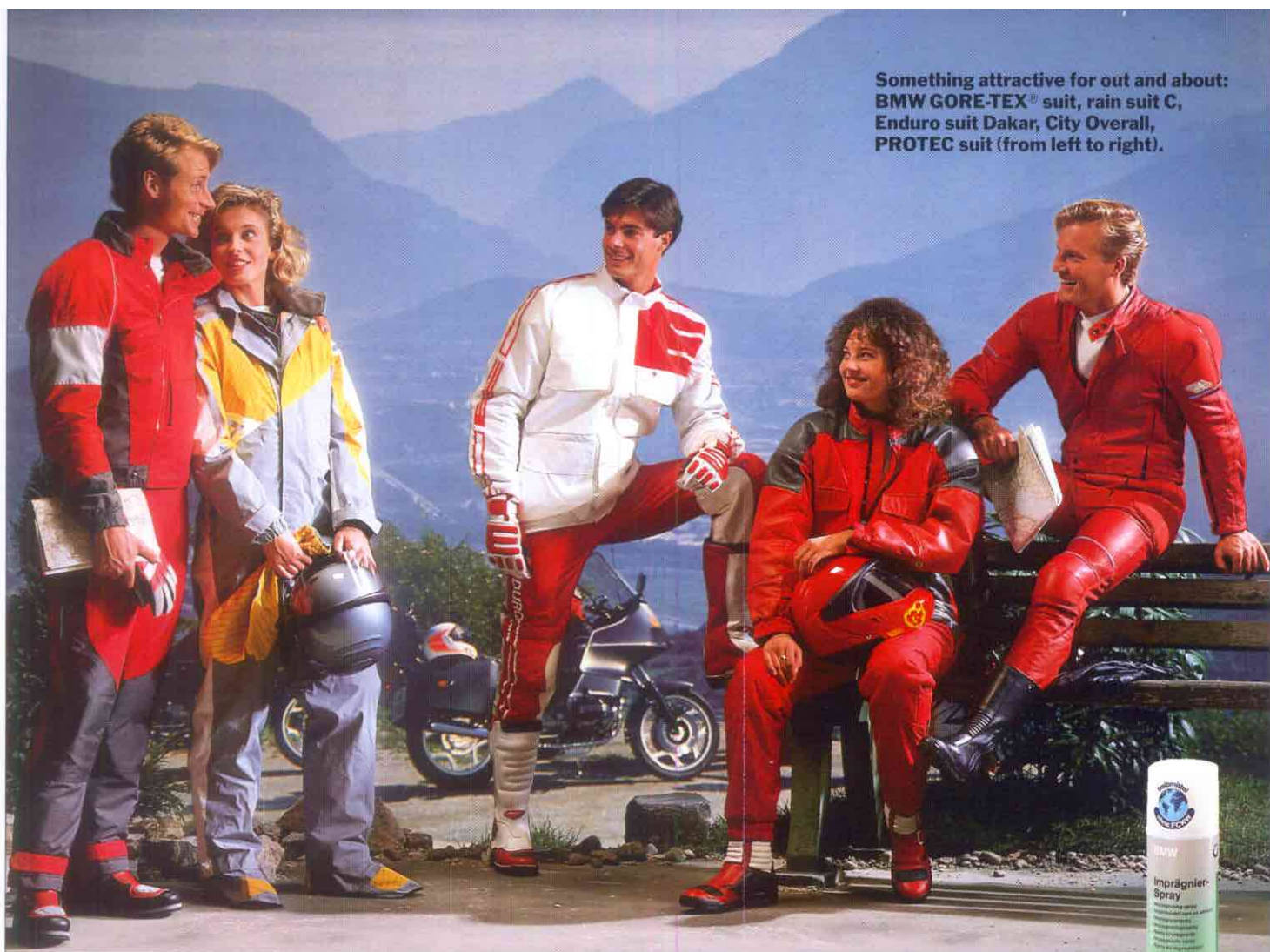
Something attractive for out and about: BMW GORE-TEX® suit, rain suit C, Enduro suit Dakar, City Overall, PROTEC suit (from left to right).