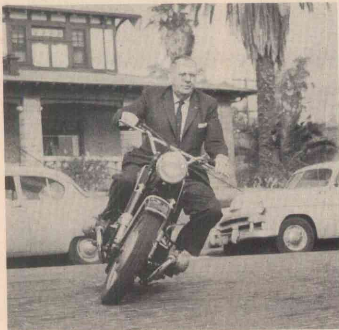
Clymer found cornering on BMW a real delight due to fine engineering design and excellent weight distribution.

box are of single unit construction and the smooth transmission of power is still further enhanced by the rubber-cushioned cardan shaft drive totally enclosed inside the right arm of the rear swinging suspension. At the end of the test a slight oil leak began to appear near the speedometer cable drive.