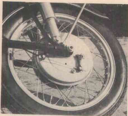
The two levers, operating one independent cam each, are easily seen in the picture above. The result: two leading shoes in the front brake and extraordinary braking efficiency.

It is specifically designed for side-car work. Nevertheless, this machine can also be considered a tough and absolutely reliable "90-plus" solo