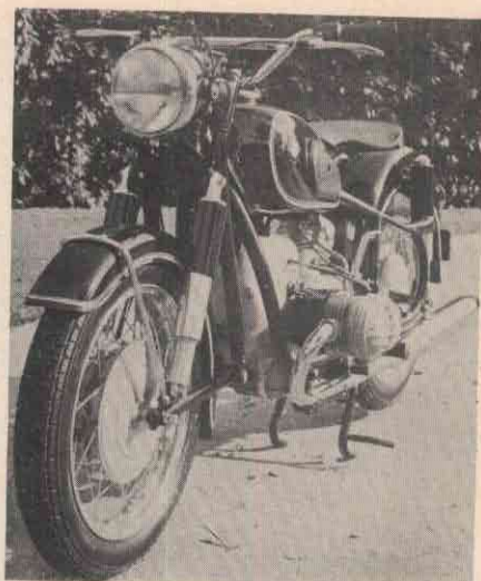
The Flanders-made Western style handlebars help to enhance even more the excellent craftsmanship and design of the R-60.

A business-like air pump is solidly attached on the right side of the machine.