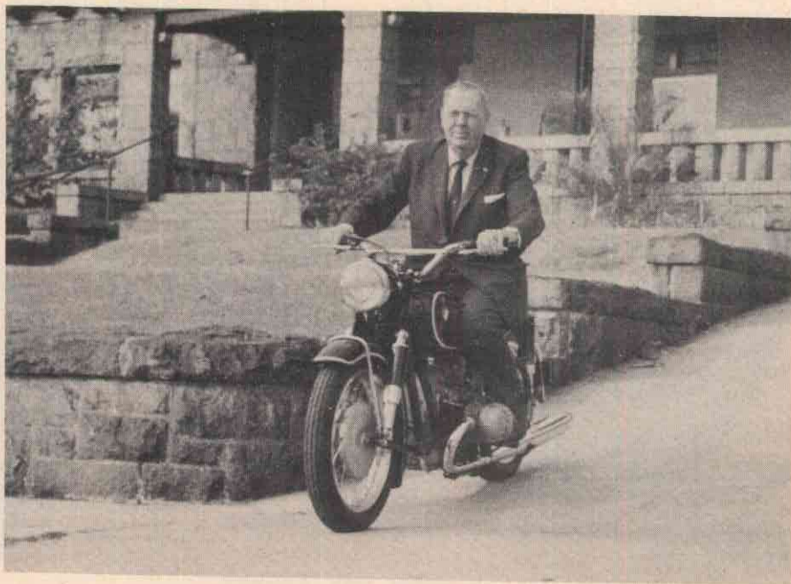
CYCLE Publisher Clymer says BMW is one motorcycle that the rider dressed in normal clothing can feel comfortable on. BMW is silent and exceptionally clean. Ease of handling and perfect balance are BMW features.

All these details, plus a braking area of 28.2 sq. inches are the BMW's reply to the ever-increasing safety requirements of today's traffic conditions.