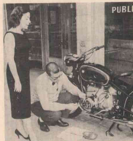
Valve lash checking was a practical proposition! No gas tank to remove nor tricky separate rocker covers to deal with.

The cushioned rubber saddle can be adjusted to suit the rider's weight. A luxurious twin seat and passenger pegs are available at extra cost. However, it is our impression that a machine which features the outstanding crafts-