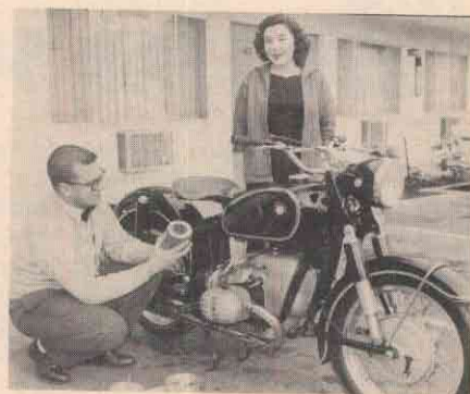
The removable element of the air cleaner was easy to reach and caused no obstruction to the air flow entering the carburetors' funnels.