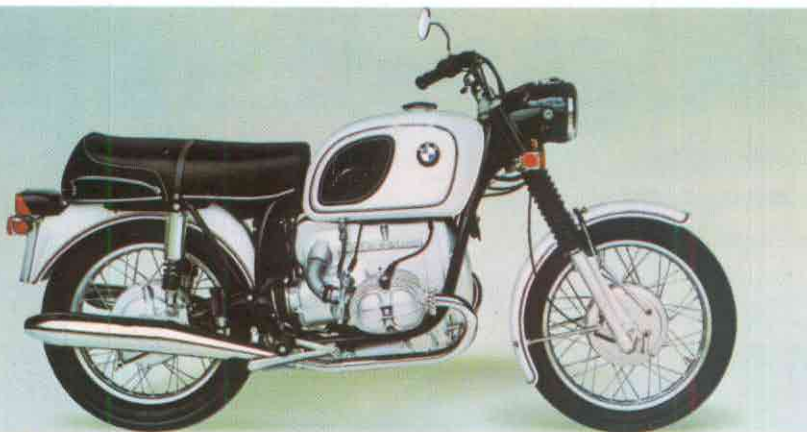
R50/5 500cc. Horsepower: 36 at 6600 rpm. Stroke/bore: 70.6/67 mm. Carburetor: Bing float. Weight: 410 lbs. Top speed: 100 mph. Acceleration: 0 to 60 mph in 9.8 seconds. Electric starter optional.