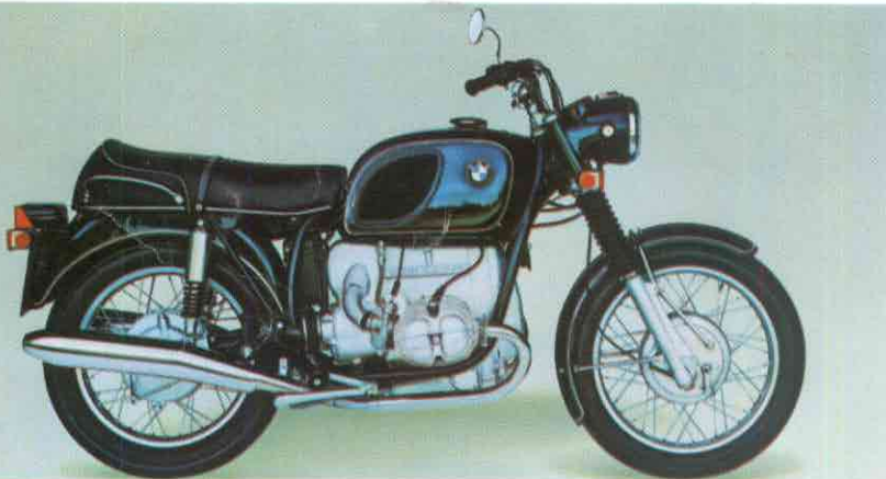
R60/5 600cc. Horsepower: 46 at 6600 rpm. Stroke/bore: 70.6/73.5 mm. Carburetor: Bing float. Weight: 421 lbs. Top speed: 105 mph. Acceleration: 0 to 60 mph in 7.8 seconds. Complete with electric starter.