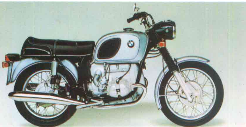
R75/5 750cc. Horsepower: 57 at 6400 rpm. Stroke/bore: 70.6/82 mm. Carburetor: Bing vacuum. Weight: 421 lbs. Top speed: 110 mph. Acceleration: 0 to 60 mph in 6.1 seconds. Complete with electric starter.

One glance at these extraordinary machines tells you they're completely new from the ground up.